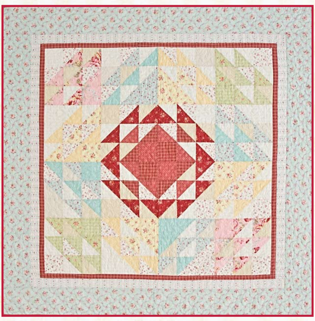
To view the Celebration fabric collection, & to download Brenda Riddle's free Parttern, please visit www.lecien.co.jp/en/hobby/

医我乳腺 我还没有我们身 我还没有我们身 我还没有我们身 我还没有我们没有我们没有