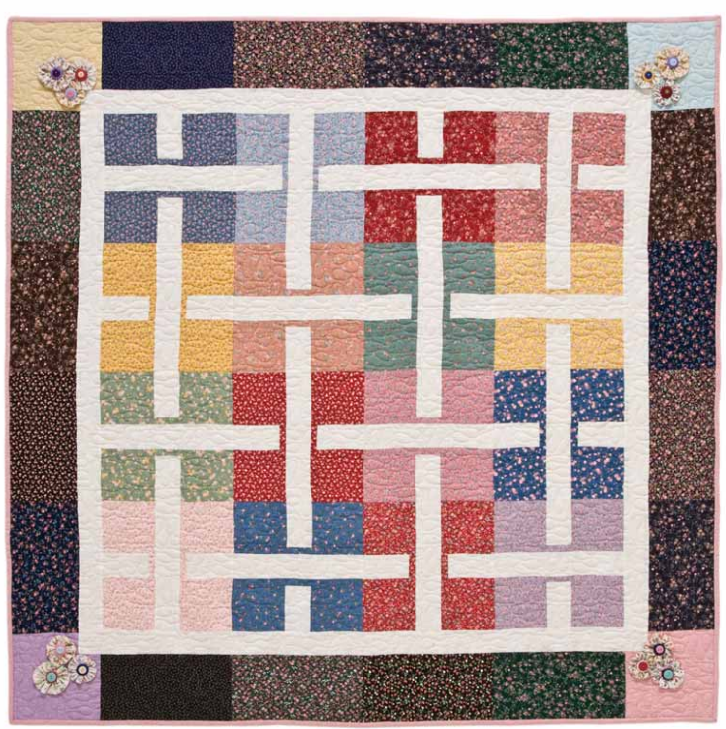
54" x 54"

TheQuiltedFish@gmail.com TheQuiltedFish.blogspot.com