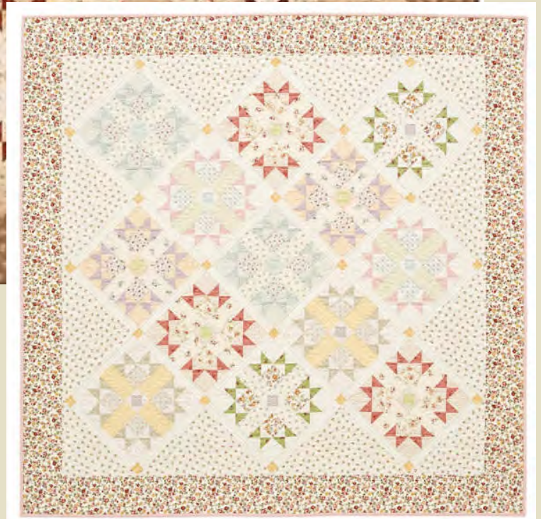
Machine quilting by JoAnn Carpenter of Cherry Creek

To View "le petit jardin" fabric collection and down load Mary's Cottage Quilt's free pattern, please visit www.lecien.co.jp/en/hobby/