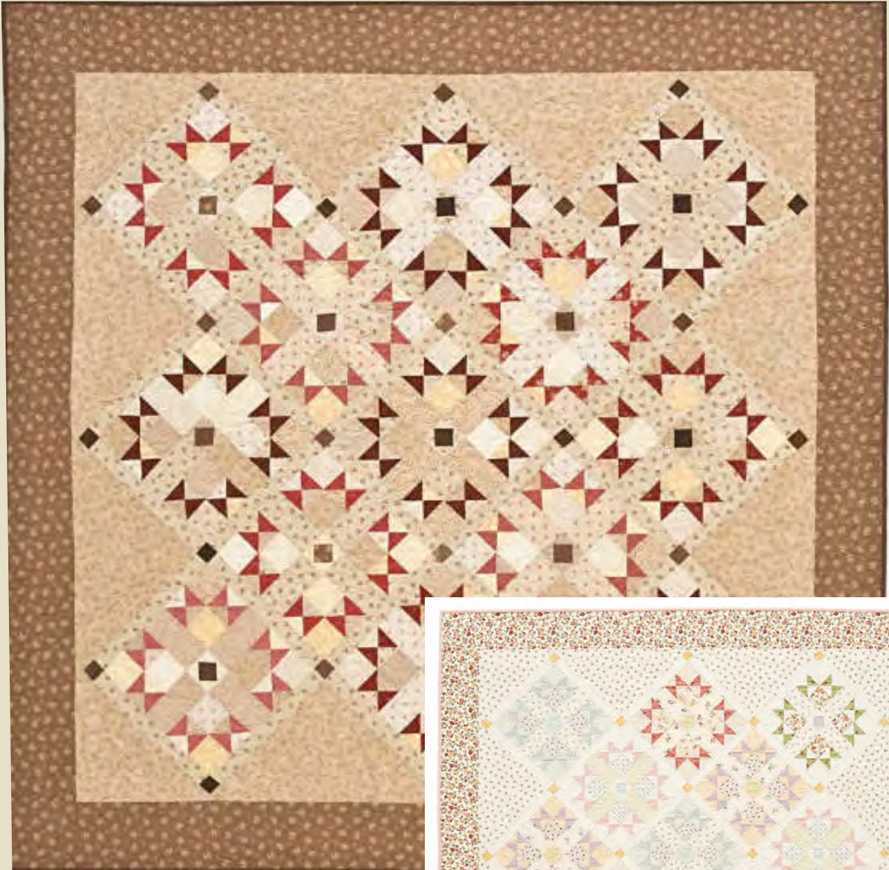
Machine Quilting by Wendy Nabhan of Eagle Mountain Quilting ( www.eaglemountainquilting.com )