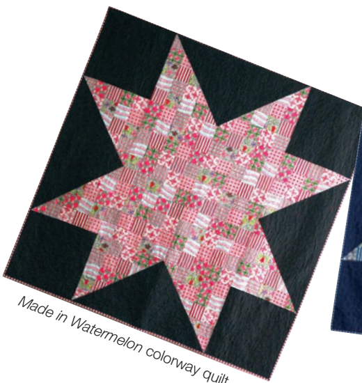
Made in Watermelon colorway quilt