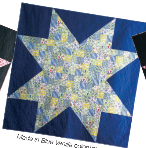
Made in Blue Vanilla colorway quilt