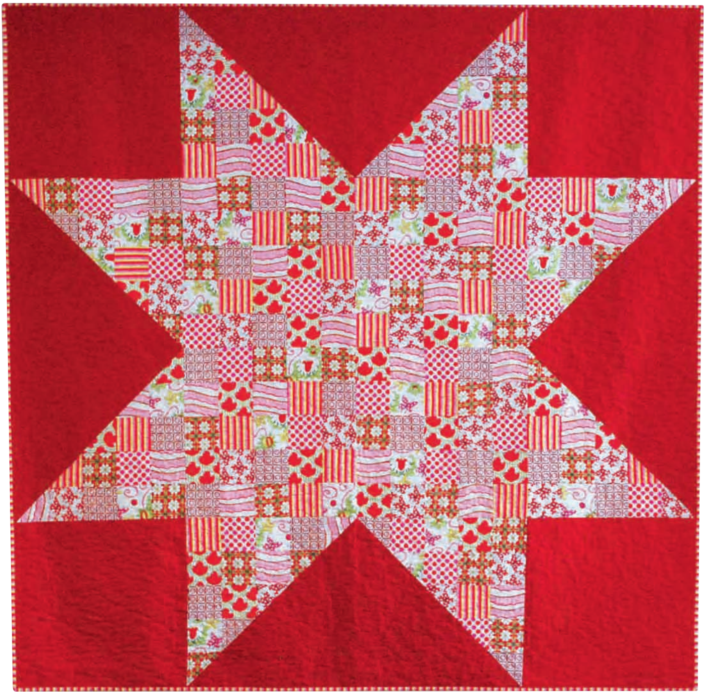
Made in Cherry colorway quilt