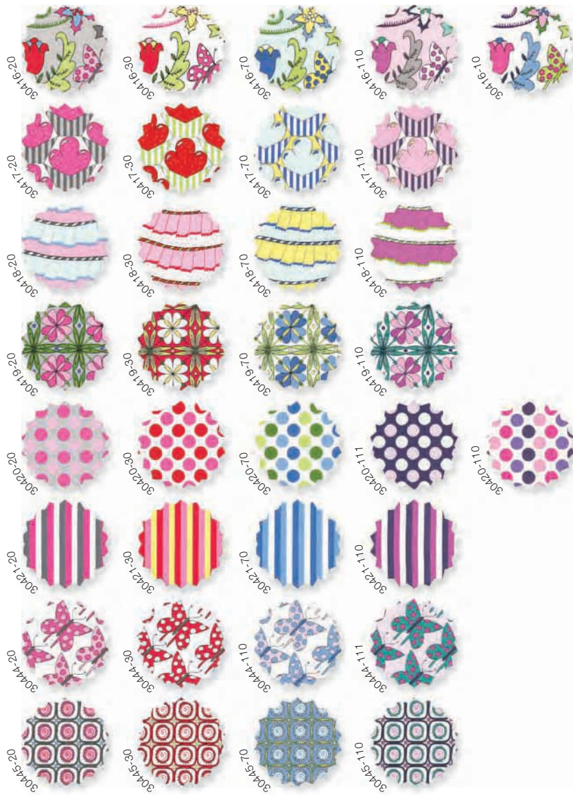
Watermelon Cherry Blue Vanilla Polar Purple Shiver