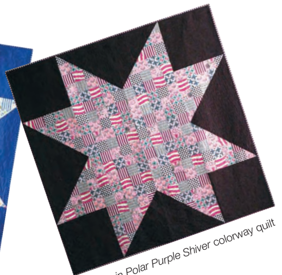
Made in Polar Purple Shiver colorway quilt